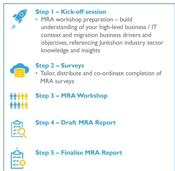
Figure 1 MRA Assignment Steps